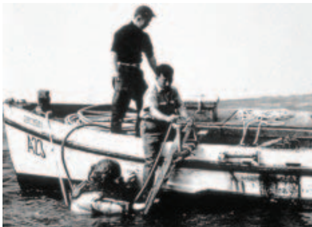
Please credit the diver image, photo by Rey Rupple, California History Room, Monterey Library. Circa, 1938 - Provided photo