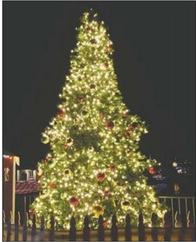
Even at the water's edge, beautiful Christmas trees are everywhere, including on Cannery Row and at Fisherman's Wharf (above).

the Community Open House at the Aquarium from Dec. 1-9. If you can show proof you live in Monterey County (your friends from San Benito and Santa Cruz are included, too), like a driver's license or even a cur-