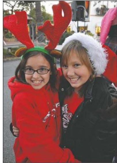
Another local tradition is the Nativity Scene at Carmel Presbyterian Dec. 7 right after Carmel's tree is lit. In Salinas, the Streets of Bethlehem Dec. 5-8 will also include a recreation of the Nativity. And from now until Dec. 25, you pretty much won't be able to swing a cat on any street corner without hitting Santa and at least one of his reindeer, such as these two young ladies on Ocean Avenue.