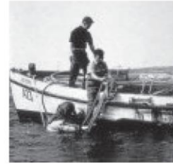
Please credit the diver image, photo by Rey Ruppel, California History Room, Monterey Library, Circa, 1938 - Provided photo

The tour is for ages 10-adult only and the cost is $20 for adults and kids are $15 (10-15 years). Group Rates are also available.